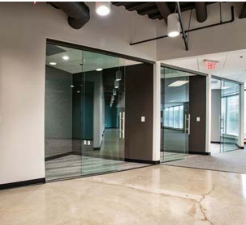
Premium entries and stand out first impressions