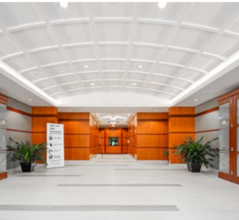
Bright and welcoming lobby