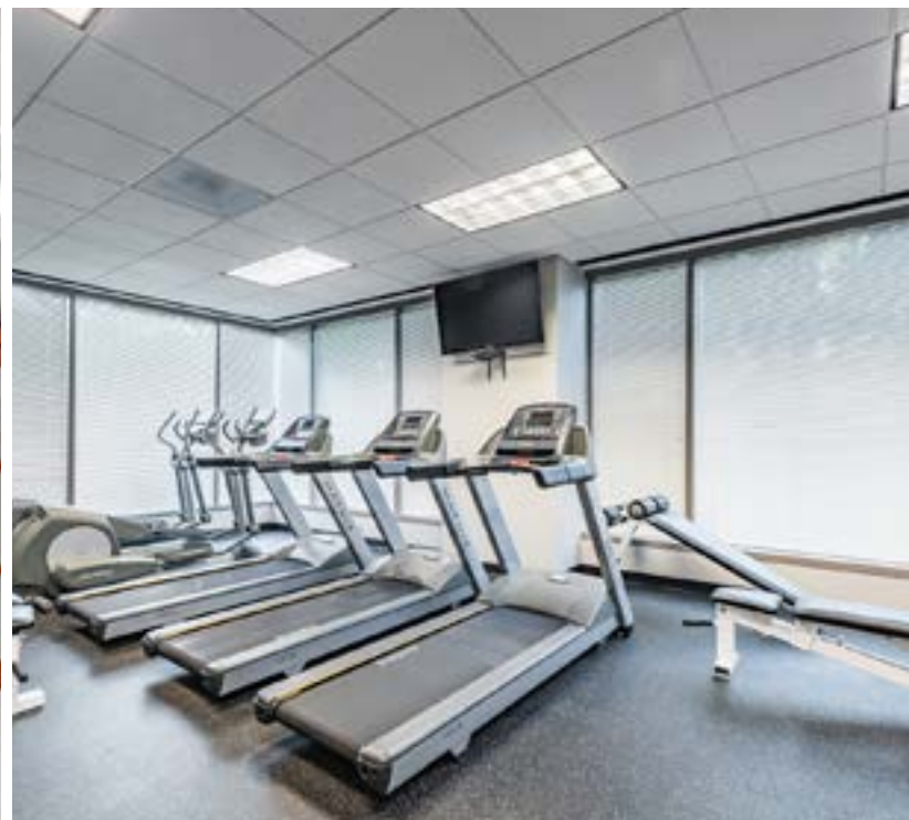
Cardio-focused communal fitness center