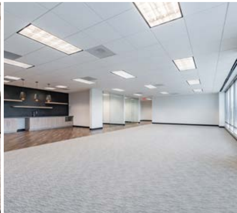
Range of spatial build-outs

For leasing information, please contact: