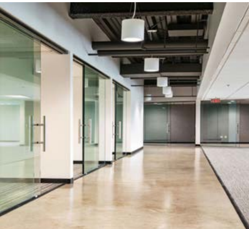
Range of contemporary finishes and lighting fixtures