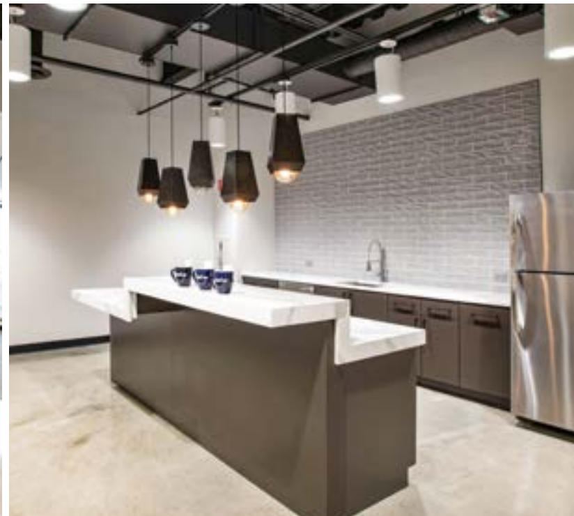
Open break rooms for space and gathering